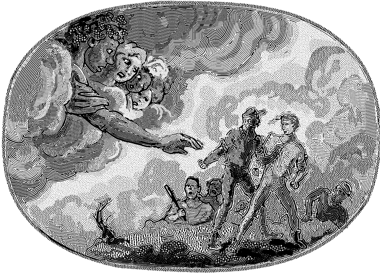
The Angels Intervene